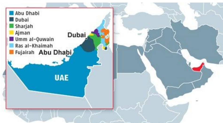
Figure 2: Maps of the UAE in the Gulf region, and of the seven emirates.

The UAE is a young nation established in 1971 by Sheikh Zayed bin Sultan Al Nahyan and is composed of seven emirates: Abu Dhabi, Dubai, Sharjah, Ajman, Umm Al Quwain, Fujairah, and Ras Al Khaimah, as shown in Figure 2 below. The UAE is a member of the Gulf Cooperation Council (GCC), which also includes the states around the Arabic Gulf of Bahrain, Kuwait, Oman, Qatar, and Saudi Arabia.