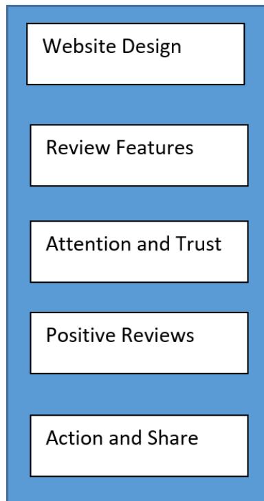
Figure 1. Conceptual framework of the study