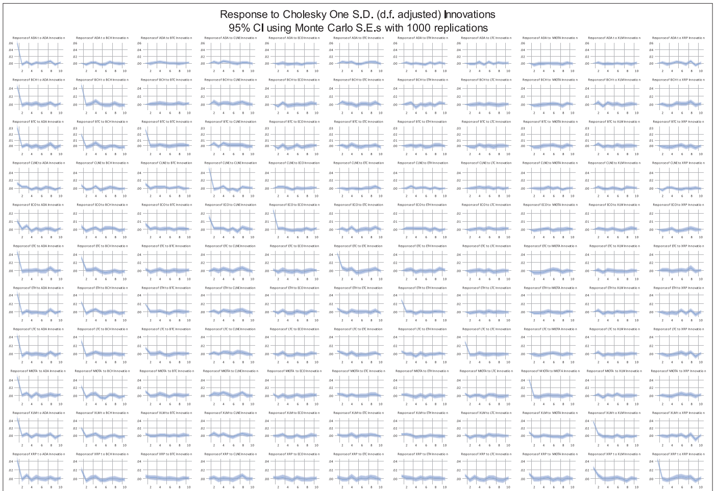
Figure 3: Estimation of the IRF model with monte carlo simulations (1000 repetitions), summary graphs for the stress period

Figure 3 shows the results of the IRF with Monte Carlo simulations (1000 repetitions) during the stress period. Overall, the comovements between sustainable crypto-currencies such as Cardano (ADA), Ripple (XRP), IOTA (MIOTA), and Stellar (XLM), with dirty cryptocurrencies (Bitcoin Cash, Bitcoin, Litecoin, Ethereum, Ethereum Classic) and with clean energy stock indices (WILDERHILL Clean Energy, Clean Energy Fuels) decreased significantly. Cardano (ADA) now has moderate comovements with the digital currencies BCH, BTC, ETH, MIOTA, and XLM, and for the sustainable energy indices CLNE and ECO. Concerning the digital currencies ETC, LTC, and XRP, we suggest some caution either in hedging or safe haven.