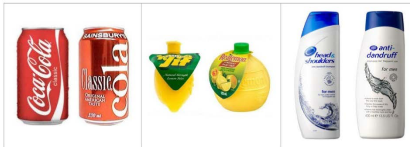
Figure 2. Examples of Copycat Packaging