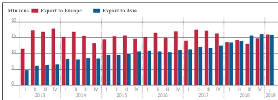
Figure 2: Comparative dynamics of Rosneft oil exports to Europe and Asia