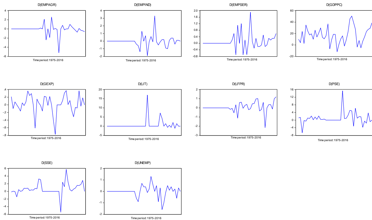
Figure 2. Plots of Differenced Data