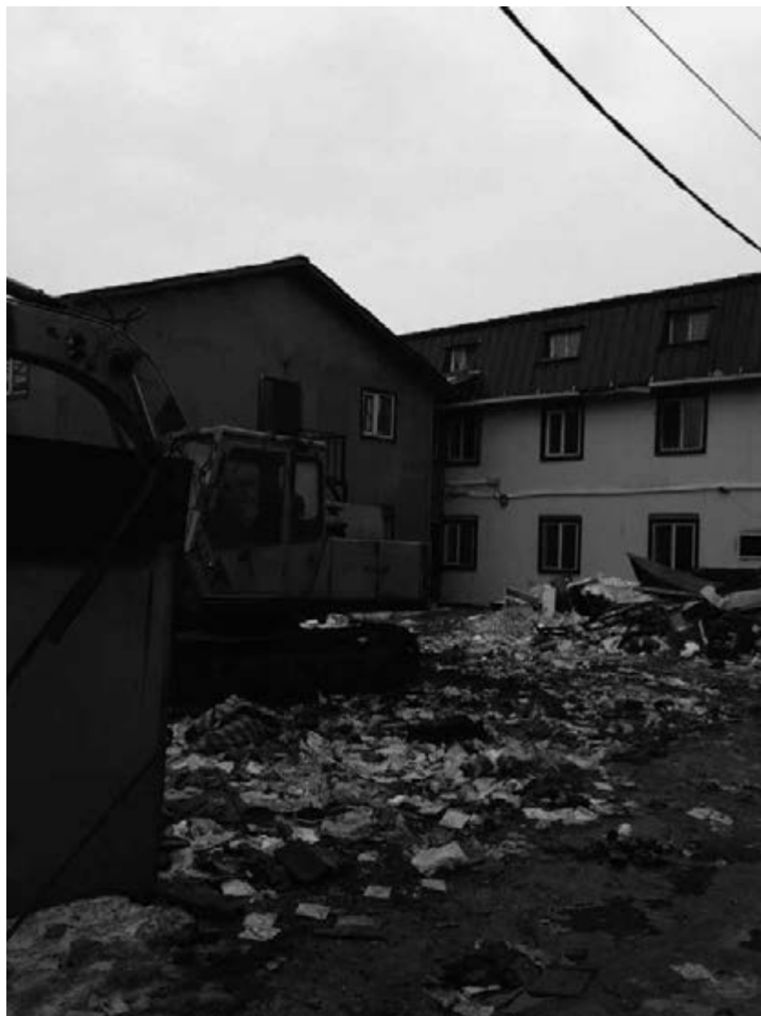
Figure 9 Chinese market in Ussuriisk, 2016

Earlier, it had been the precarious balance of the mutuality of two parties across the border that had enabled the frontier market economy to be sustained and flourish. In accounting for what happened next, it is useful to refer to Gellner. According to him (1988, 143), it is often the state ‘that destroys trust’, replacing the delicate equilibrium of social cohesion with