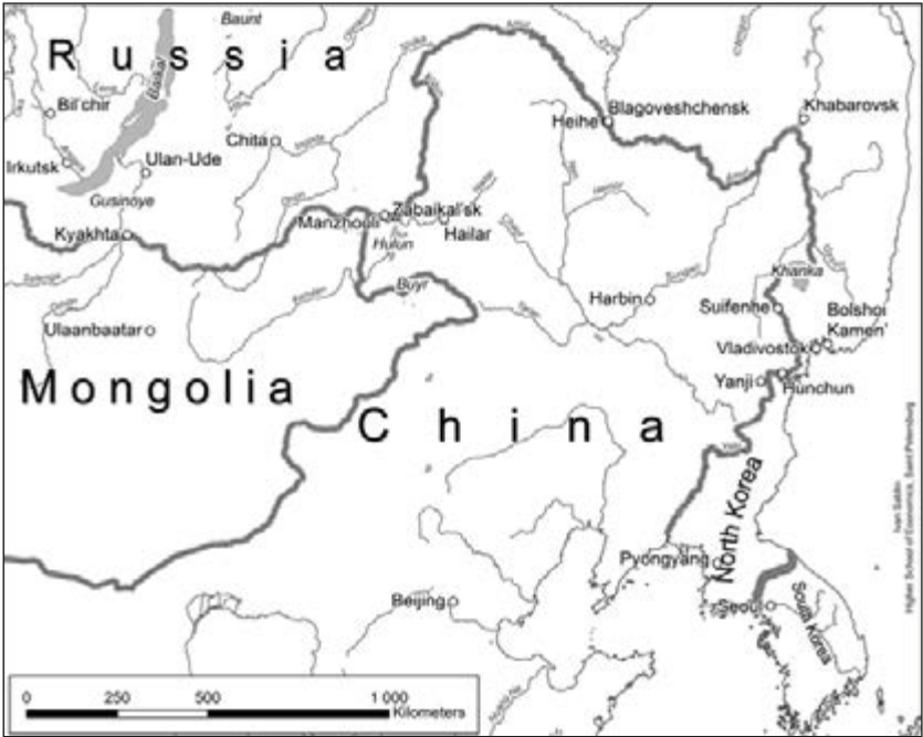
Figure 1 Map of north-eastern Russia-China borderland