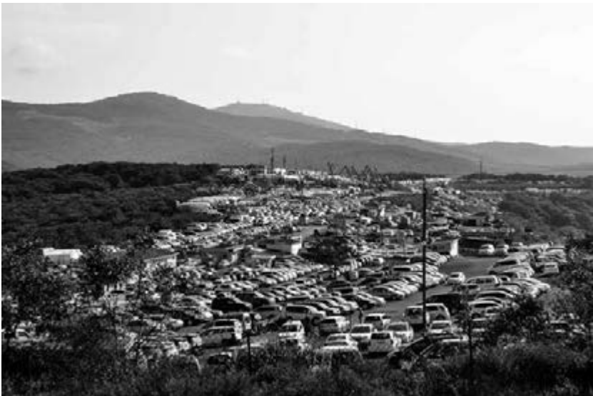
Figure 6 The ‘Green Corner’ market for used Japanese cars, Vladivostok

The first event took place in 2008, when Vladivostok witnessed one of the largest public demonstrations since the dissolution of the Soviet Union. 40,000 people amassed on the streets, holding anti-Putin placards for the first time, to protest the newly introduced customs duties on the import of used Japanese cars. The port city still houses one of the largest open-air used car markets in Russia. Locally known as ‘Green Corner’ and perched on a series of hilltops above the city, the market operates as a central hub for customers from across the Russian Far East and Siberia. For years, this business represented one of the main staples of Vladivostok and Primorsky Krai, with tens of thousands of people directly and indirectly involved (Kalachinsky 2010, 3). In response to the new taxes, the local anger and resentment spilled over. Not trusting the local police, Moscow had to send