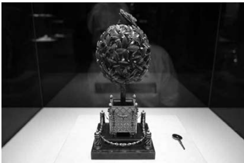
Figure 15 Carl Fabergé's Easter egg, made predominantly of jade from a private collection of Viktor Vekselberg, the fourth richest person in Russia. The object is on display at special private museum in Saint-Petersburg, Russia

was part of an elitist lifestyle and jade was never reconfigured as a Russian stone in a democratic sense: it did not become popular or recognizable, and no artisan craft arose to work the stone into objects of value. This situation was in some ways similar to the heyday of jade in Chinese history, when only the members of royal family and those close to it were permitted to own jade. Even though jade objects like imperial eggs are of Russian origin, their price now is determined at auctions abroad, and foreign experts play important roles in the process. In this respect Russian buyers are similar to Chinese ones: they buy these objects because of the emotional ties they feel towards them.