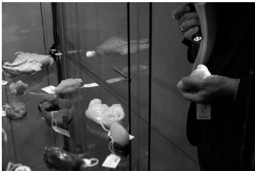
Figure 14 Chinese buyers scrupulously explore an old Chinese object put on sale at Sotheby's auction house in London, UK

auction houses such as Christie's, Sotheby's, and Bonhams (see Figure 14). There are various scientific procedures that can help estimate whether a jade object is authentic, but there are several obstacles to this, so no analysis can provide absolute certainty. 3 Recently produced fakes are the easiest to detect, because the activity embodies the contextual features of its time: a different attitude to the speed of production and stone quality. 4 Experts and object retailers are usually more educated and experienced than forgers and can detect what shapes and patterns refer to which periods. Forgers often replicate objects that they have never seen in real life, guided only by illustrations. Sometimes they wrongly interpret these illustrations and