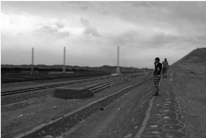
Figure 8 Buyan standing reflectively by an unused railway, 2013

China and Mongolia have been trying to find a common ground by linking their 'Belt and Road' and 'Steppe Road' projects at the governmental level, as laid out by the presidents (Mongolian: tolgoi , 'heads') of the two states in recent years. This is a basic framework for cooperation that needs to be activated through more practical connectivity between them, including infrastructural hardware like railways (see Figure 8), roads, or tunnels, as well as cultural and social interaction between the two peoples. In other words, the cooperation between the two countries not only relies on good