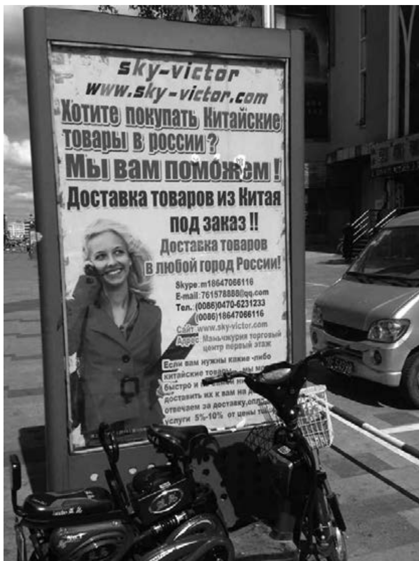
Figure 17 Advertisement for a company offering help with on-line purchases in Manzhouli, China

to the brothers' invention (i.e. they are mediators between Russian purchasers and the Chinese bazaar), but some are more similar to the technical architecture of Taobao itself. For example, the company 'Russian Bridge' simultaneously offers online shopping on Taobao and other means and