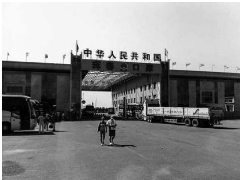
Figure 5 The border crossing at Hunchun-Kraskino