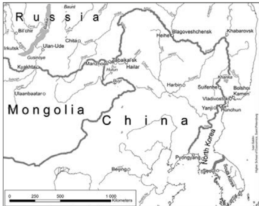
Figure 1 Map of north-eastern Russia-China borderland