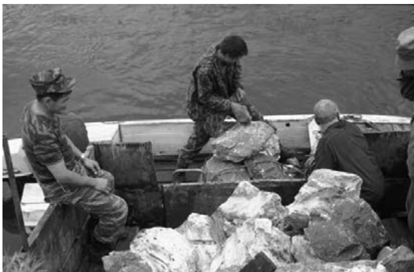
Figure 16 One of the Sunshine's operations. Guards reload raw jade to transport it across a river. Jade is on its way from mine to warehouse

through the reindeer farm, which was simultaneously used as a storage place, watch post, and canteen. All of these changes were also very much in favour of the reindeer herders, who had often suffered from the lack of supplies before.