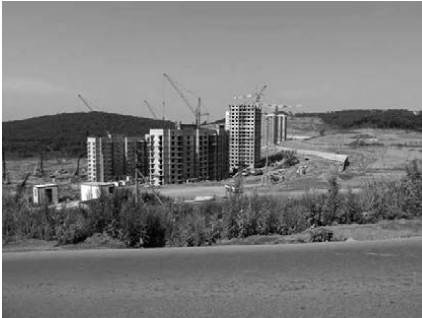
Figure 13 The 'Eastern Breeze' complex, Vladivostok, 2013