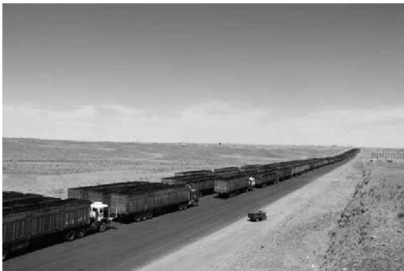
Figure 7 Trucks lining up to cross the border to transport coal from Mongolia to China, 2013