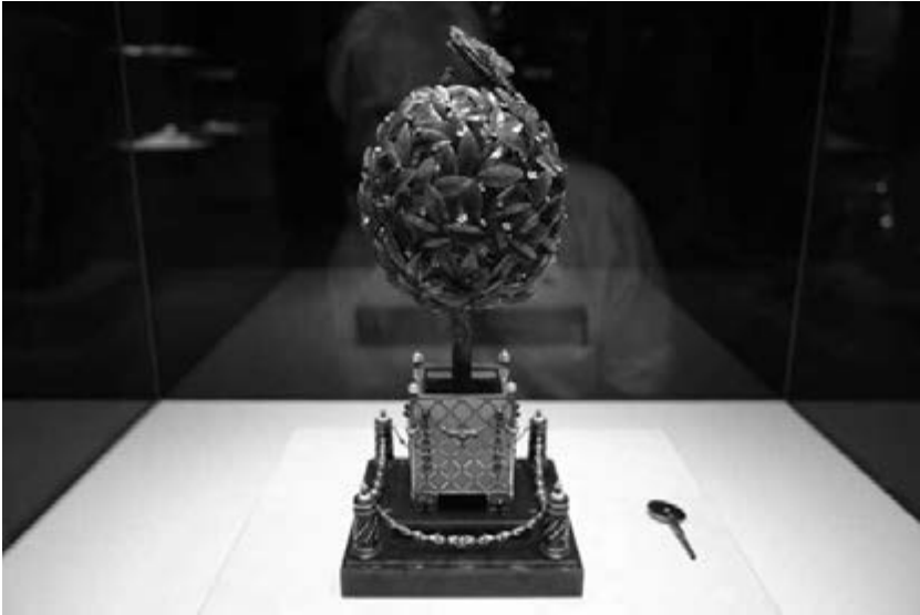
Figure 15 Carl Fabergé’s Easter egg, made predominantly of jade from a private collection of Viktor Vekselberg, the fourth richest person in Russia. The object is on display at special private museum in Saint-Petersburg, Russia

was part of an elitist lifestyle and jade was never reconfigured as a Russian stone in a democratic sense: it did not become popular or recognizable, and no artisan craft arose to work the stone into objects of value. This situation was in some ways similar to the heyday of jade in Chinese history, when only the members of royal family and those close to it were permitted to own jade. Even though jade objects like imperial eggs are of Russian origin, their price now is determined at auctions abroad, and foreign experts play important roles in the process. In this respect Russian buyers are similar to Chinese ones: they buy these objects because of the emotional ties they feel towards them.