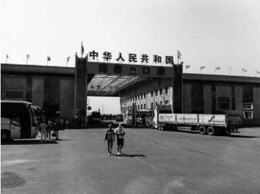
Figure 5 The border crossing at Hunchun-Kraskino