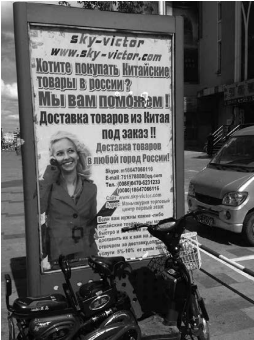
Figure 17 Advertisement for a company offering help with on-line purchases in Manzhouli, China

to the brothers' invention (i.e. they are mediators between Russian purchasers and the Chinese bazaar), but some are more similar to the technical architecture of Taobao itself. For example, the company 'Russian Bridge' simultaneously offers online shopping on Taobao and other means and