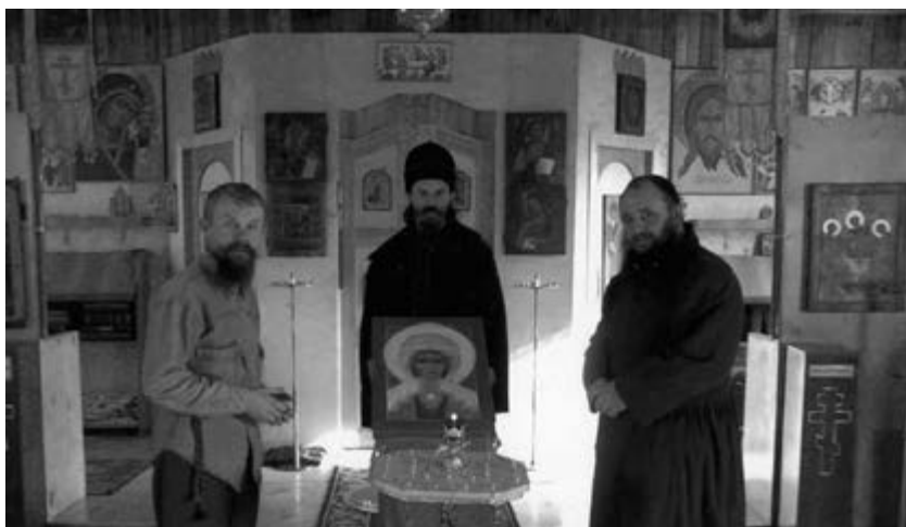
Figure 11 A s'ezd ('congress') of Far Eastern Old Believers in the mid-1990s held in Bolshoi Kamen'