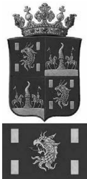
Figure 2 The Coat of Arms and official flag of Kyakhta, Russia

this is not just a head of a dragon: as an 1861 document states, it was meant to depict ‘a severed head ( otvannaya golova ) with red eyes and red tongue’; 9 when the dragon as a whole signified China itself. The same symbol of the guillotined dragon became the official flag of Kyakhta town, which is still in use. 10 It should be noted that a beheaded and vanquished dragon is one of the most popular motifs of Russian orthodox iconography, depicting Saint George’s victory over pagans. Indeed, the newly established border was perceived by Russians as the front line of the confrontation between European Christianity and Asian pagans. Perhaps this is one reason why Kyakhta was so rich in large Orthodox churches; it has the most outstanding and impressive ecclesiastical architecture in all of Asiatic Russia east of the Urals. The largest and most monumental, the Church of the Resurrection ( Voskreseniya ), 11 was built just a few meters from the border next to the