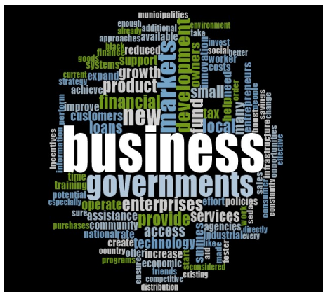
Fig. 3. Word cloud exhibiting growth and development strategies for SMMEs in the 4IR

This was an important theme as it dealt with the strategies and support required to drive firm performance and development in the unstable corporate climate. In terms of government support, funding was the highest ranked factor. Funding was the core of attaining sustainability from the start for small businesses. Small businesses always had difficulties in terms of finance and capital and trying to adhere to the 4IR required substantial investment [22]. New products and services also required research and development as well as escalating production costs [20]. Therefore, more funding opportunities must be provided by government.