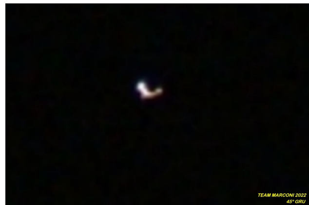
Fig. 1. Plasma in the atmosphere appeared at 11:49 p.m.

3.2. Anomalous light phenomenon, Berceto (Italy) July 15, 2022 – 11:49 p.m. Local Time. Still at the same monitoring location, at 11:22 p.m. (Local Time) the ELF receiver recorded a very faint peak between 1 Hz and 4 Hz. A few minutes later, at 11:49 p.m. (Local Time) also in the same area, along the side of the mountain ridge, a very intense light phenomenon suddenly appeared, moving from left to right and changing shape (Fig. 1). Two photographs were taken in succession with a Fujifinepix S3Pro digital camera with a shutter speed of 0.5 sec at ISO 1600, zoom to 70 mm, f 4.0, recording the change in shape and brightness of the phenomenon itself. Observing the luminous phenomenon at magnification, it can be seen that initially it appeared as if it consisted of two luminous cores, while in the second photo the two cores appear to have merged together, changing completely in shape with change in brightness as well. Astrometric analysis, in false colors, confirmed the change in brightness and shape of the light phenomenon, showing the presence of two initial bright «cores» that later merged together, changing their profile. The Point Spread Function (PSF) of the distribution of photons of light in 3D and photometry show that the phenomenon emitted light of its own and as if it was within contained in a kind of energy «bubble», such that it confined the light itself.