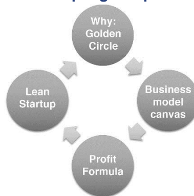
Figure 1: A four-step model for adapting companies to the changing landscape

This methodology involves asking crucial questions at the beginning of the digital journey in order to work out how to adapt the company to the big data movement and compete in a blurry industry landscape. These questions are aimed at helping executives answer the following questions: