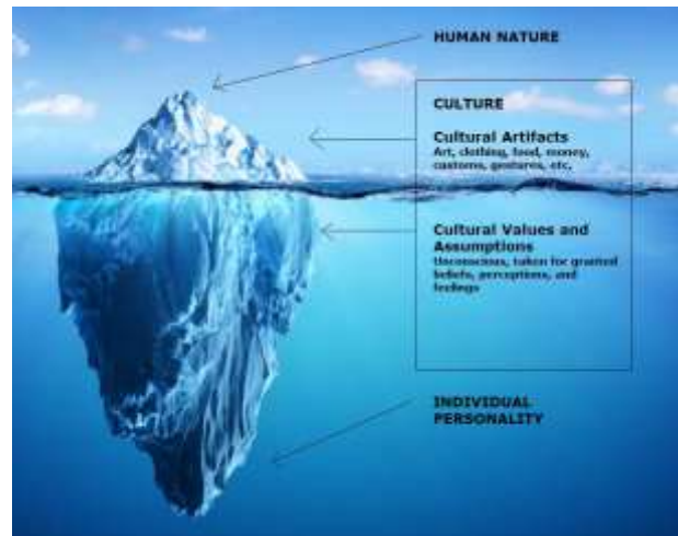
Figure 2. Correlation Between Personality Traits and Cultural Intelligence (Livermore, 2009, p.85)

personality, presented by David Livermore (Livermore, 2009, 2015), are not taken into account at their proper value.