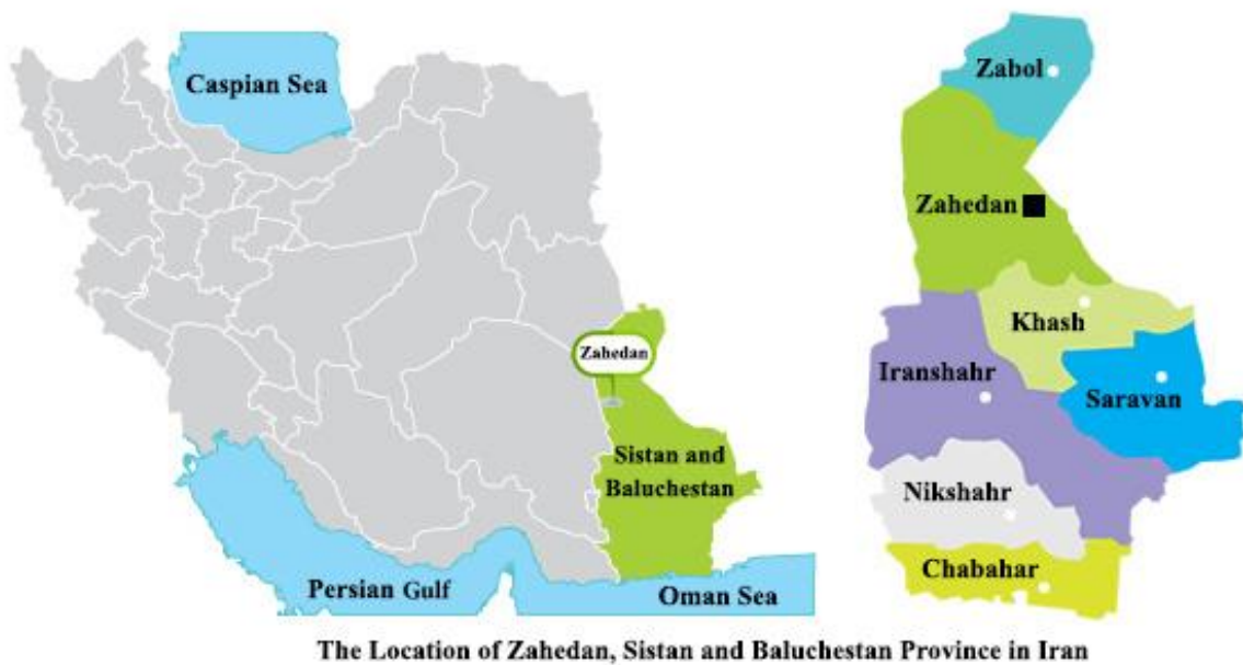
Map1. The location of Zahedan, Sistan and Balouchestan Province, Iran